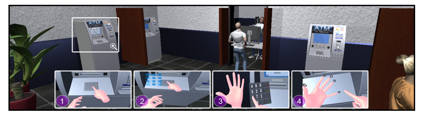
Figure 1: We propose <u>Remote Virtual Reality for simulating Real-world Research</u> ( RVR^3 ) to evaluate novel real-world prototype systems. We implemented two real-world authentication systems for automated teller machines (ATMs) (i.e., Hand Menu ( \mathfrak{O} ) and Tap ( \mathfrak{O} )) and compared their usability against Traditional 4-digit PIN authentication ( \mathfrak{O} ) and Glass Unlock ( \mathfrak{O} ) [59].

Mohamed Khamis University of Glasgow Glasgow, United Kingdom mohamed.khamis@glasgow.ac.uk