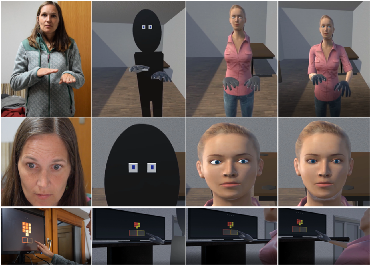
Figure 2: Participants watched pre-recorded videos where a human in the real world or avatars in a virtual environment performed (a) mid-air gestures, (b) eye gaze movements, and (c) touch gestures. In all interaction identification tasks participants had access to the same view as depicted in the figures above.

analysis is therefore based on 20 participants (11 male, 9 female, self-reported) aged between 18 and 54 ( M=31.79 , SD=10.51 ). Out of the 20 participants, 19 (95%) mentioned that they have heard about the term “Virtual Reality” before and 9 participants (45.0%) voiced that they had hands-on experience with VR. In the following, we report on the results of participants’ (a) interaction identification performance, the number of correctly identified gestures for touch, mid-air, and eye gaze; (b) perceived mental workload when observing the interactions (NASA-TLX questionnaire [28]); (c) preference of the avatars; and (d) perceived realism of the avatars. Our analysis is based on (5 touch gestures + 5 mid-air gestures + 8 eye gaze gestures) \times 20 participants = 360 observations.